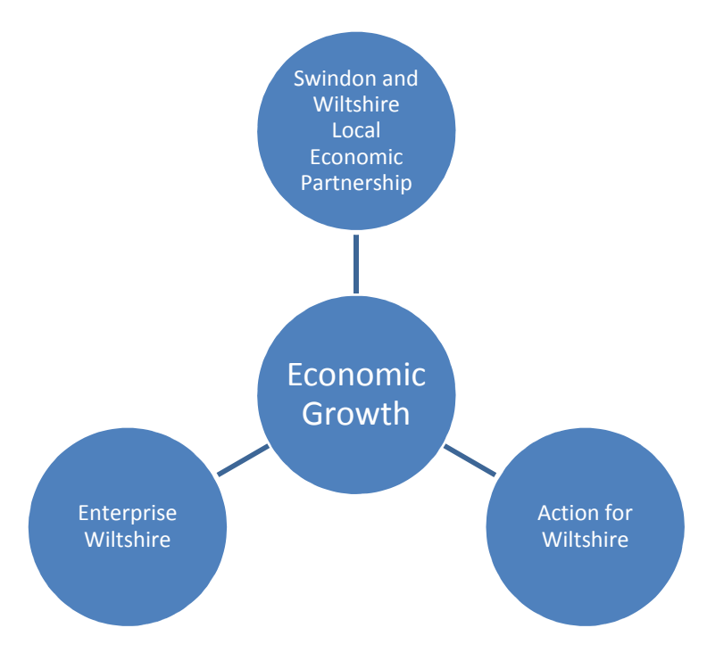
Figure 3: Key Strategic Partnerships for Economic Growth