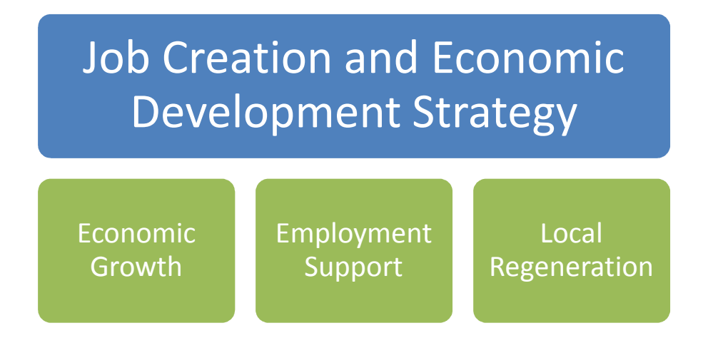
Figure 1: Job Creation and Economic Development Strategy